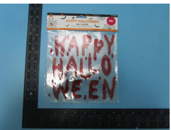
Sample as received