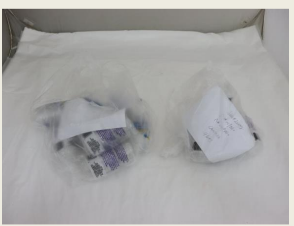
END OF REPORT