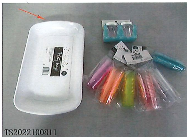
PARTY TRAY 3PK DISPOSABLE/SHOT GLASS PLASTIC/SALT & PEPPER SHAKER SET