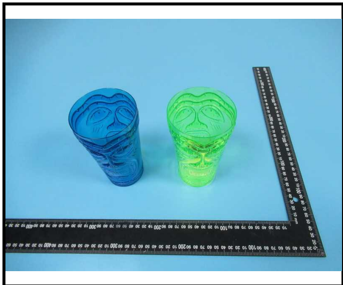
Photograph of Sample