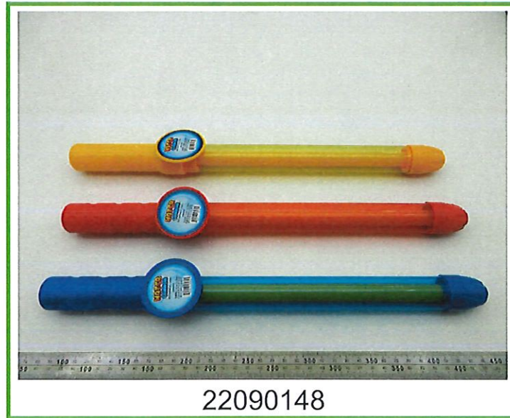
Photo of sample