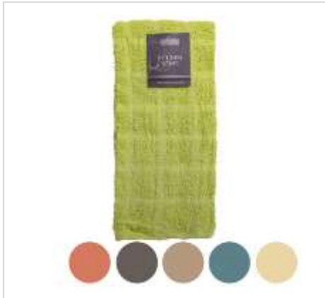
KT16088 KITCHEN TOWEL 15X25 ASSORTED COLORS PEGGABLE CASE PK: 72 $ 0.90