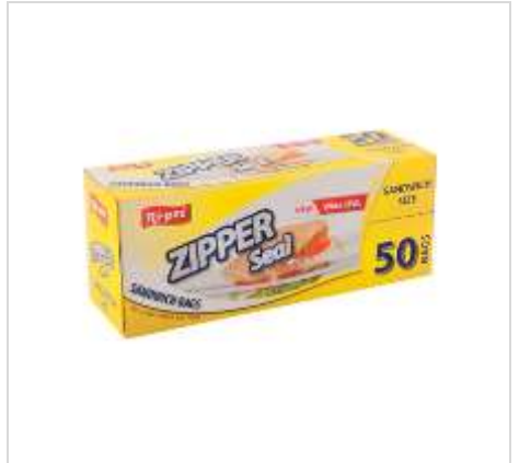
27050N STORAGE BAGS 50CT SANDWICH ZIPPER SEAL CASE PK: 24 $ 0.92