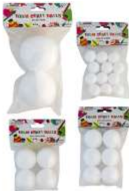
G28047 CRAFT FOAM BALLS 4AST SIZES 2/4/6/12PK