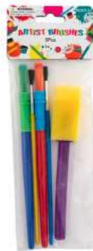
G28186 ARTIST PAINT BRUSHES 5PC MIXED 3AST SIZE PLASTIC CRAFT PBH