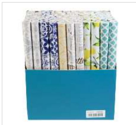
ASST59-72 SHELF LINER ADHESO - ASST PRINTS 18IN X 1.5YD DISPLAY CASE PK: 72 $ 0.90