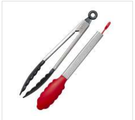
G25554 TONGS METAL W/PP HEAD 2AST COLORS BLACK/RED 10.125IN L B&C CASE PK: 72/36 $ 0.80