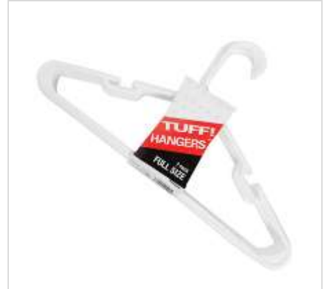
44117 HANGERS TUBULAR WHITE 7CT FULL SIZE STACKABLE COUNTER DISPLAY CASE PK: 20 $ 1.80