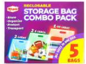
27805 STORAGE BAGS 5CT COMBO PACK ASSORTED SIZES