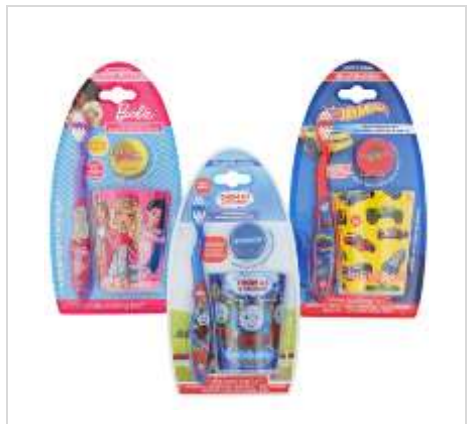
32781 TOOTHBRUSH KIDS LICENSED 3PC SET BARBIE, HOT WHEELS, THOMAS&FRIENDS CASE PK: 24 $ 1.00