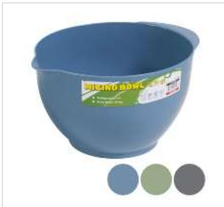
42029 MIXING BOWL 67 OZ 3 ASSORTED COLORS GREEN BUE GRAY CASE PK: 48 $ 0.95