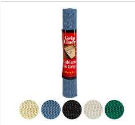
1275A6-48N SHELF GRIP LINER RANDOM COLORS 12IN X 5FT CASE PK: 48 $ 0.80