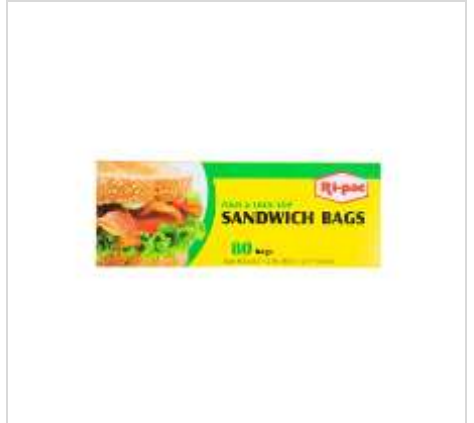
27080 STORAGE BAGS 80CT FOLD TOP SANDWICH BOXED CASE PK: 24 $ 0.90