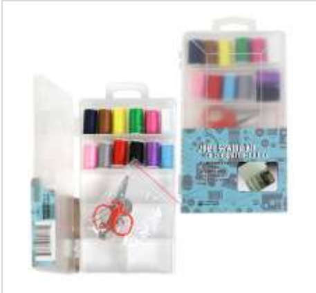
G20171 SEWING KIT IN COMPARTMENT BOX 20PC PEGGABLE SEWING BOX CASE PK: 48/24 $ 1.20