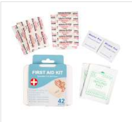
14253 FIRST AID KIT 42PC IN PLASTIC CASE CASE PK: 24 $ 0.97