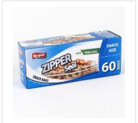
27060T STORAGE BAGS 60CT SNACK ZIPPER SEAL CASE PK: 24 $ 0.90