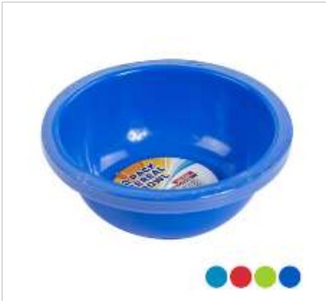
415410P BOWL 3PK 28-OZ 7IN DIA PLASTIC 4 COLORS IN PDQ CASE PK: 48 $ 1.00