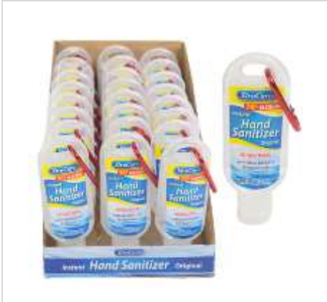
5441T HAND SANITIZER W/CLIP 1.8 OZ XTRA CARE 2 - 24PC PDQ CASE PK: 48 $ 0.82