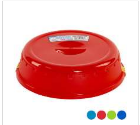
410040N MICROWAVE FOOD COVER 2PK 4 TRANSPARENT COLORS IN PDQ CASE PK: 48 $ 1.15