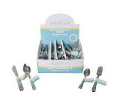
G25401T FLATWARE STAINLESS S/3 ASST KNIFE/FORK/TBS/TSP PDQ 108 SETS CASE PK: 108 $ 0.87