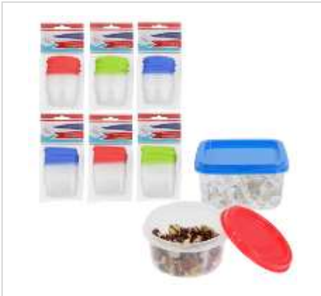
G41196 STORAGE CONTAINER MINI 6PK 2.5OZ RED/GREEN/BLUE SQUARE OR ROUND STACKED LIDS/BASES CASE PK: 48 $ 0.80