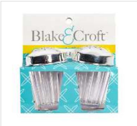
G25718 SALT & PEPPER SHAKER SET PLASTIC 2.75IN W/PLATED LIDS CASE PK: 48/24 $ 0.85