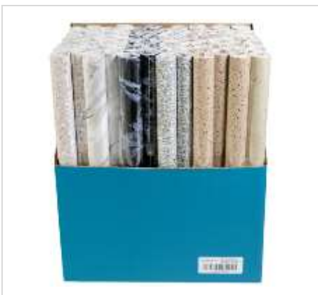
ASST56-72 SHELF LINER ADHESO - STONES 18IN X 1.5YD DISPLAY CASE PK: 72 $ 0.90