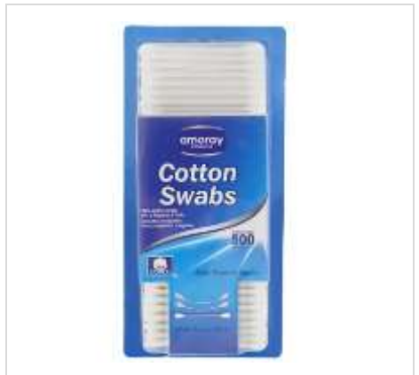
66618 COTTON SWABS 500CT PLASTIC STICK AMORAY CASE PK: 48 $ 0.90