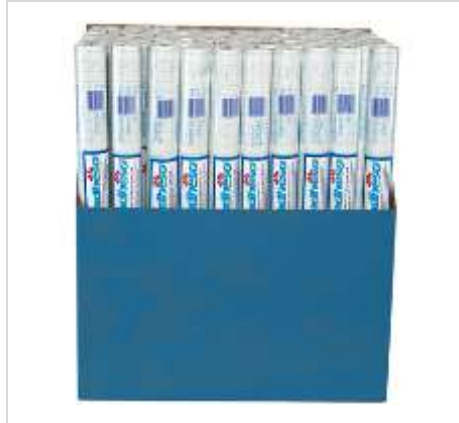
ASST00-72 SHELF LINER ADHESO - CLEAR 18IN X 1.5YD DISPLAY CASE PK: 72 $ 0.90