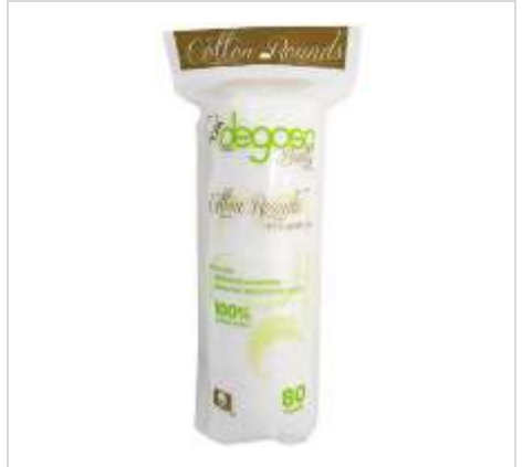
231401N COTTON ROUNDS 80CT 100% COTTON PEGGABLE & RESEALABLE POLY BAG CASE PK: 24 $ 0.90