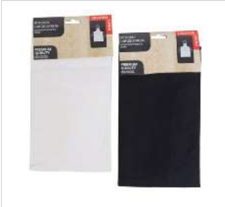
15990 APRON 24X34 ASSORTED COLORS CASE PK: 48 $ 2.60