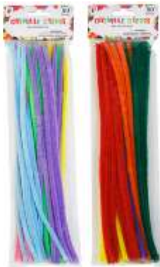
G28086 CHENILLE STEMS 50CT 12IN PASTEL OR BRITES