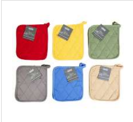
17115N POT HOLDERS 2PK 7X8 6ASST CLRS GREEN,BLACK,RED,GREY,TAN,BLUE CASE PK: 72 $ 1.00