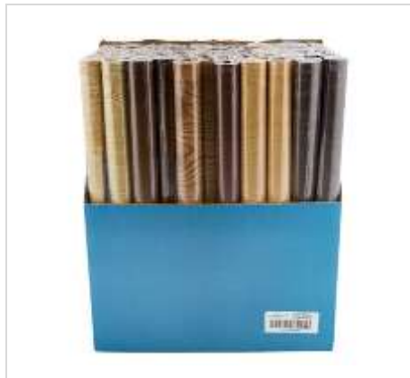
ASST57-72 SHELF LINER ADHESO - WOOD GRAINS 18IN X 1.5-YD DISPLAY CASE PK: 72 $ 0.90