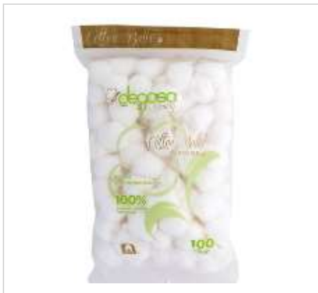
236061 COTTON BALLS 100CT 100% COTTON PEGGABLE & RESEALABLE POLY BAG CASE PK: 24 $ 0.90