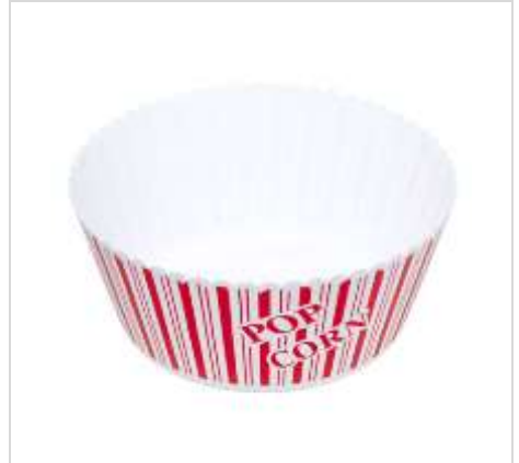
410160 POPCORN BOWL ROUND RED/WHITE STRIPED 10.25D X 4.75H IN PDQ CASE PK: 48 $ 1.05