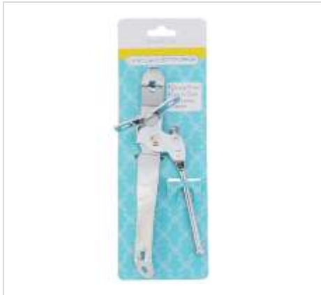
G250870 CAN OPENER 3-WAY CHROME-PLATED METAL/KITCHEN CASE PK: 72/24 $ 0.85