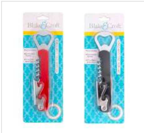
G25584T CORKSCREW/ BOTTLE OPENER 4-N-1 RED OR BLACK 6IN L CASE PK: 72/24 $ 0.95