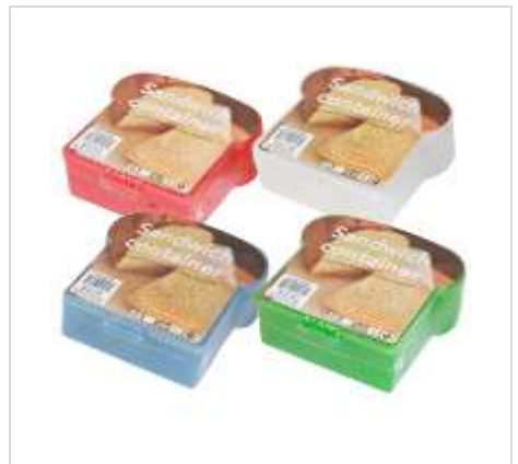
41569T SANDWICH CONTAINER W/HINGED TOP PLASTIC 4 COLORS IN 24PC PDQ 2.5 CUP CASE PK: 24 $ 0.85