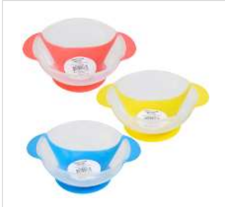
G41367 BOWL W/SUCTION BOTTOM 3ASST CLRS 13.5OZ/6.42X4.7X2.17IN CASE PK: 36 $ 0.75