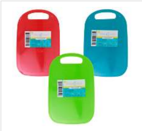
G25961 CUTTING BOARD 13X8.5IN 3AST CLR PP PLASTIC W/HANDLE RED/GREEN/TURQUOISE CASE PK: 24 $ 0.85