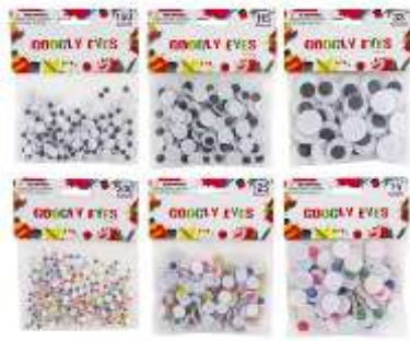
G28063T CRAFT GOOGLY EYES 6 SIZES BLACK OR MULTI COLOR 33-300CT