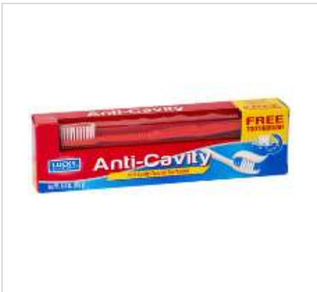
10688 TOOTHPASTE W/BRUSH 6.4 OZ ANTI- CAVITY BOXED LUCKY CASE PK: 24 $ 0.95