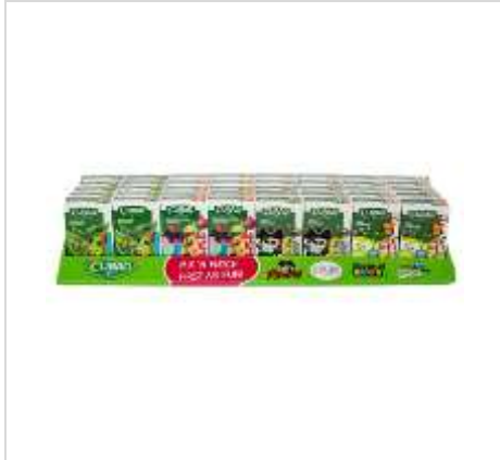
933979 BANDAGES KIDS 20CT 40PC DISPLAY CURAD 4 ASSORTED CASE PK: 40 $ 0.85