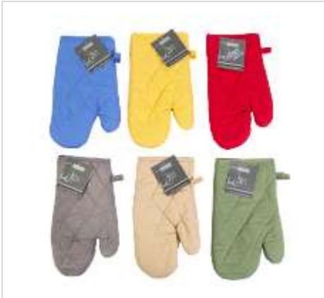
17122N OVEN MITT 6 ASSORTED COLORS CASE PK: 72 $ 1.00