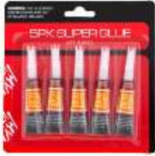
G09259 SUPER GLUE 5PK 0.5OZ EA