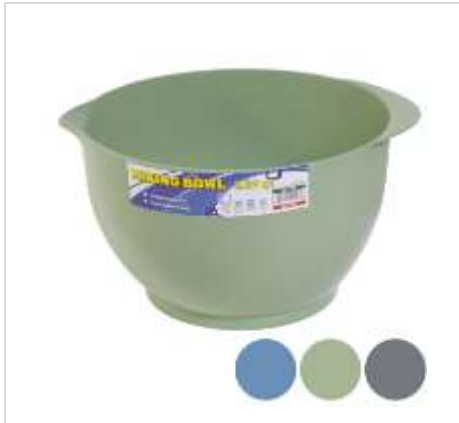
42028 MIXING BOWL 115 OZ 3400ML 3 ASSORTED COLORS GREEN BLUE GRAY CASE PK: 36 $ 1.45