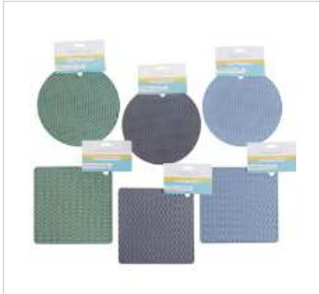
G25731CS POT HOLDER TRIVET SILICONE SQUARE & ROUND HONEYCOMB PATTERN 3 AST CLRS CASE PK: 24 $ 1.20