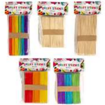
G28156 CRAFT STICKS WOOD 80PC REG/40PC LARGE NATURAL/MULTICOLOR 24PCPDQ