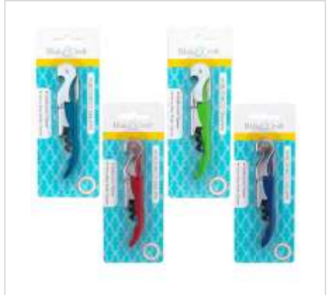
G25742CS CORKSCREW WAITERS 4 ASST CLRS B&C CASE PK: 48/24 $ 0.95