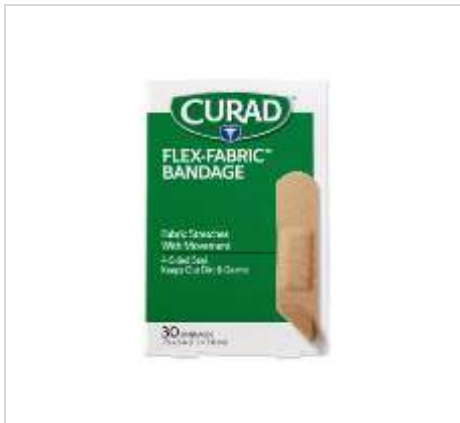
300214 BANDAGES CURAD 30 CT FLEX FABRIC BOXED CASE PK: 24 $ 0.85