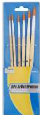
G02785 ARTIST PAINT BRUSH 6PC SET#2 #4 #6 #8 #10 #12