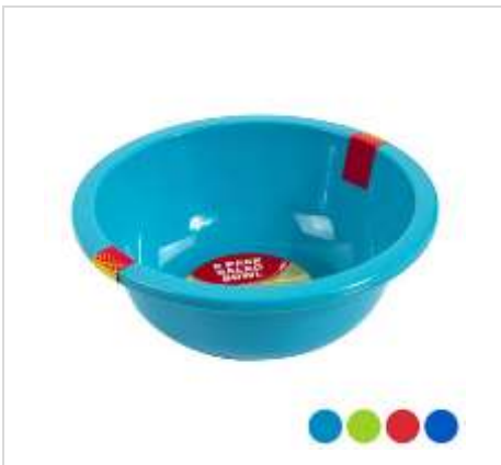
415430P BOWL 2PK 60-OZ 9IN DIA PLSTC 4 COLORS IN PDQ #SALAD BOWL CASE PK: 48 $ 0.97