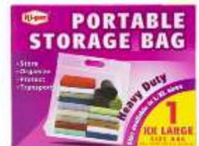
27801T STORAGE BAG PORTABLE XX LARGE ZIPPER SEAL 24 X 20 HEAVY DUTY