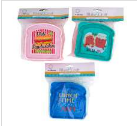
41362 SANDWICH CONTAINER W/POP TOP LID PLASTIC 3PRINT BPA FREE 5X1.5IN CASE PK: 36 $ 1.20