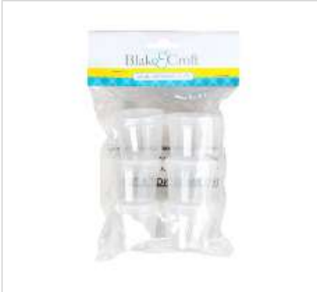
G256160 SALAD DRESSING CUPS 6PK 1.2OZ REUSABLE KITCHEN PB/HDR CASE PK: 48/24 $ 0.80