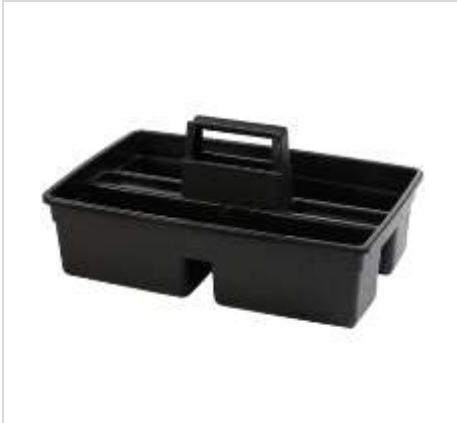
8213 CADDY MULTIPURPOSE BLACK PLASTIC 11X8X17 CASE PK: 12 $ 4.50